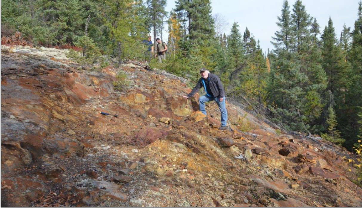
Figure 4. Relf Lake - 30m x 40m gossan zone exposure of moderate to steeply north-dipping and steeply SE-pitching zinc (Fe-rich sphalerite) mineralization in weathered quartz-sericite-pyrite schist.