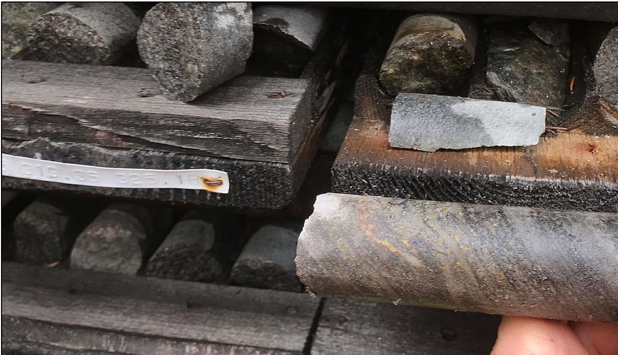
Figure 5. Historical unsampled drill core samples stacked from 2007-2008 drilling at Relf Lake Zone showing unweathered brown ferroan sphalerite-pyrite±chalcopyrite lenses hosted by a quartz-feldspar-biotite±garnet schist 'matrix' with banded 'volcanoclastic' texture.